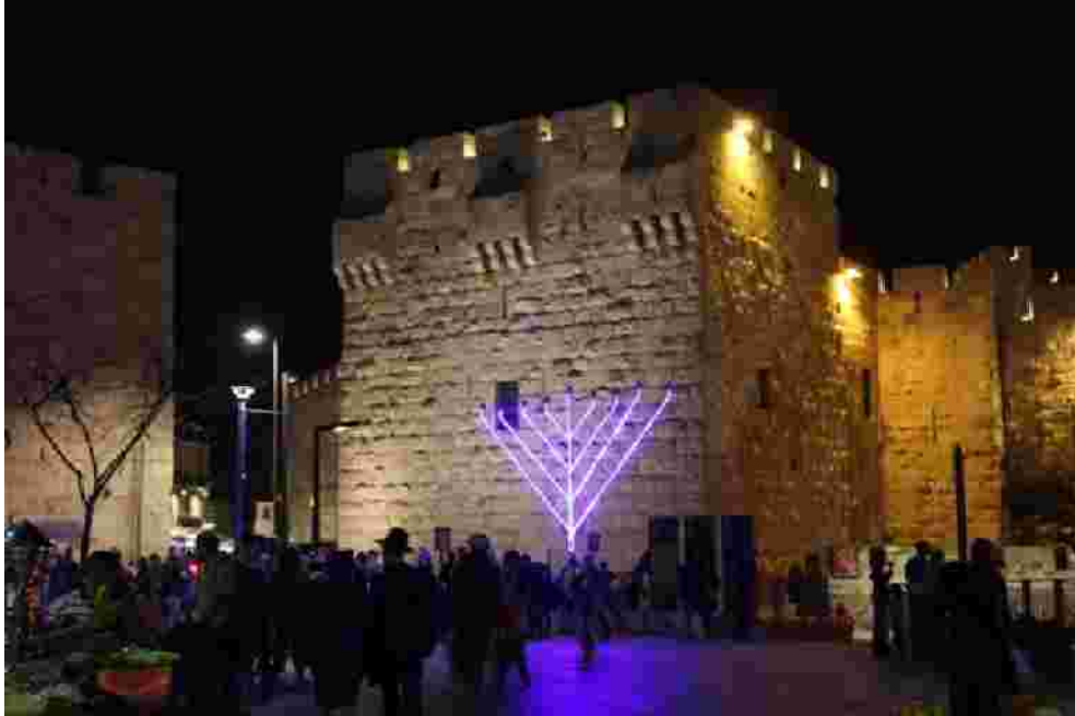
Hanukkah in front of the Old City walls in Jerusalem.

The first rainbow, observed after the Flood, was seen in Kislev. "And G-d said: 'This is the sign of the covenant which I set between Me, and yourselves, and between every living being that is with you, unto eternal generations. I have placed my bow in the cloud, and it shall be a sign of a covenant between Me and the Earth.' " "This is the sign of the covenant" – G-d showed Noah the bow and said to Him: "This is the sign of which I spoke".