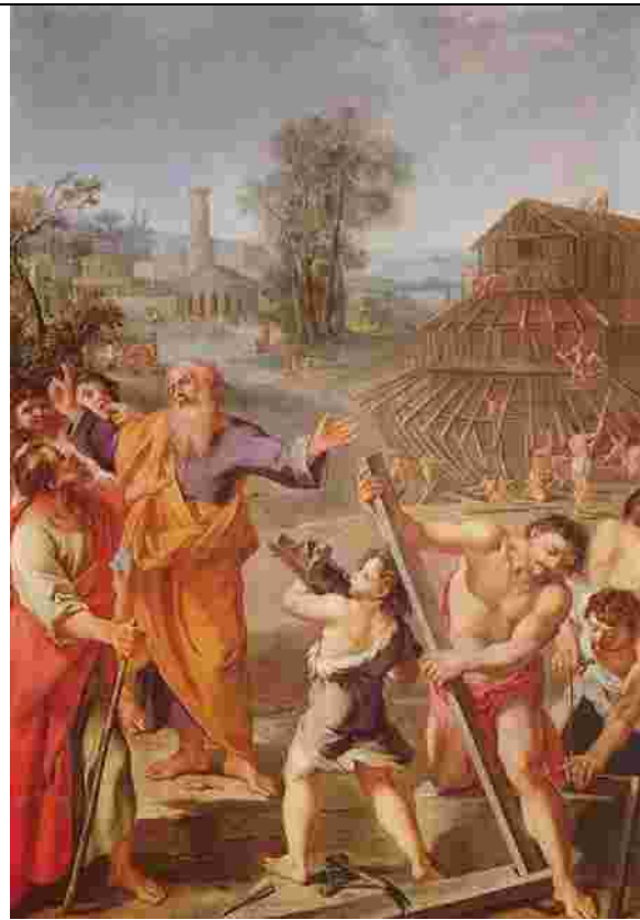
17 Mar-Cheshvan ( circa 2105 BCE)

It is as though the Jewish destiny has seen fit to give us a month off, a time to return to ourselves and our daily lives, to place into daily practice the great lessons afforded us by the challenges of the two previous months. It is as though God says to us, so to speak, “My children, let Me see how you put into your daily lives the holiness and commitments that you accumulated during the months of holidays and the preparation for them.”